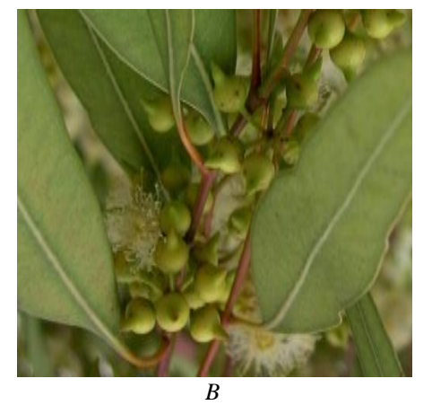
Fig-1: (A) Leaves of Eucalyptus globulus (B) Fruits of Eucalyptus globulus