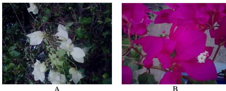
Fig-1: (A) White Bougainvillea spectabilis Willd (B) Purple Bougainvillea glabra Choisy Origin: (Botanical garden of University of Karachi)